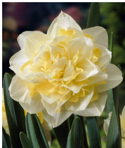
Daffodil Double "White Lion"