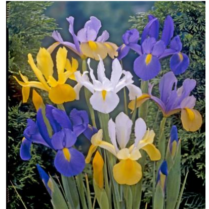
Dutch Iris Mixed