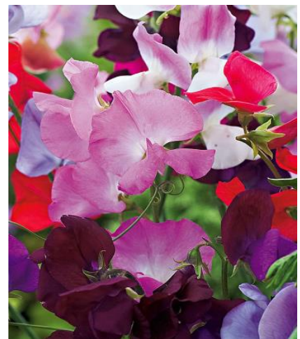
Sweet Pea - Early Multiflora