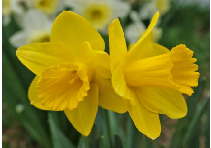
Daffodil "King Alfred"